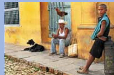
Cocked Hat