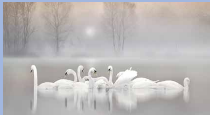
Morning Mist