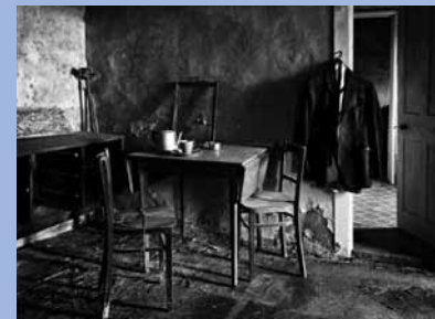
As it Was Left

Any artist wishing to display work in the 26th Annual Art Exhibition please contact Ballymoney Town Hall on 028 2766 0230 for details.